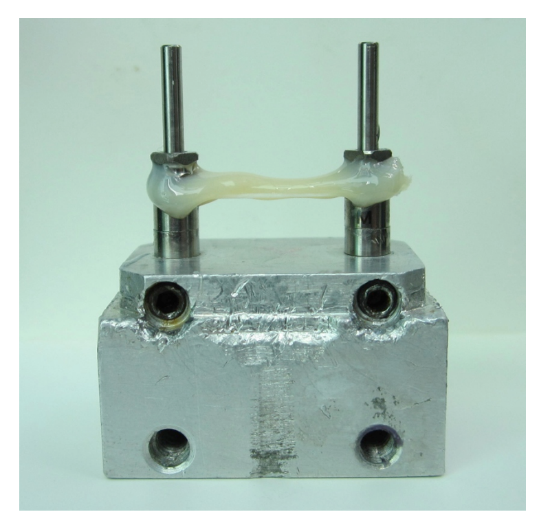
Fig. 4. Splinted squared copings using dental floss and bisacrilica resin Protemp 4 (3M ESPE, Seefeld, Germany).