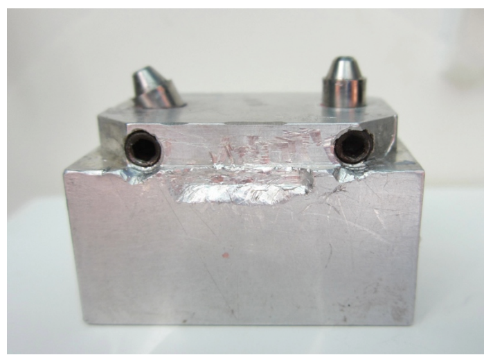
Fig.1. Aluminum block