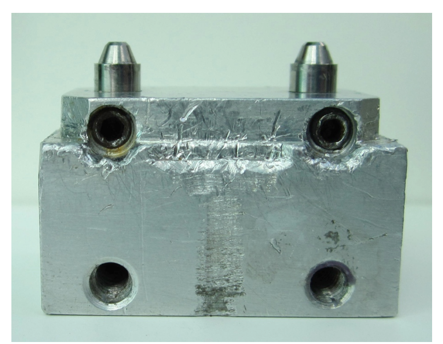
Fig. 1. Aluminium Block.