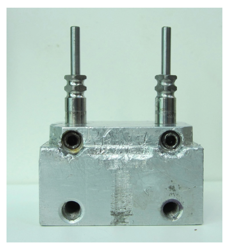
Fig. 2. Squared impression copings.