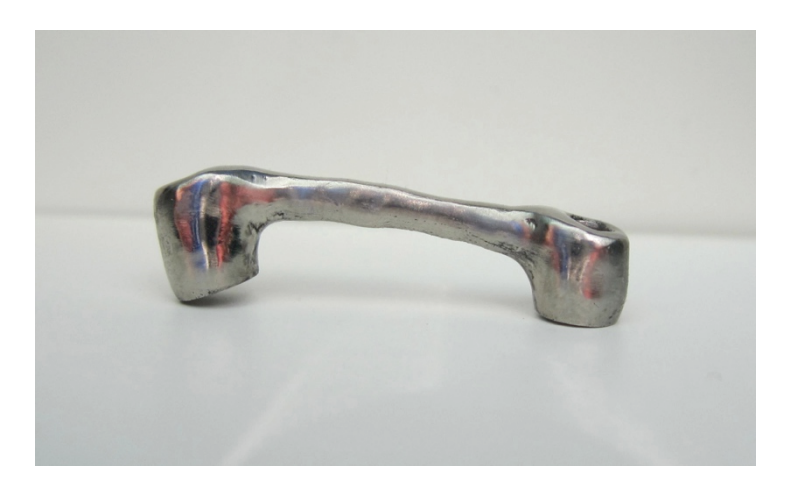
Fig. 2. Framework