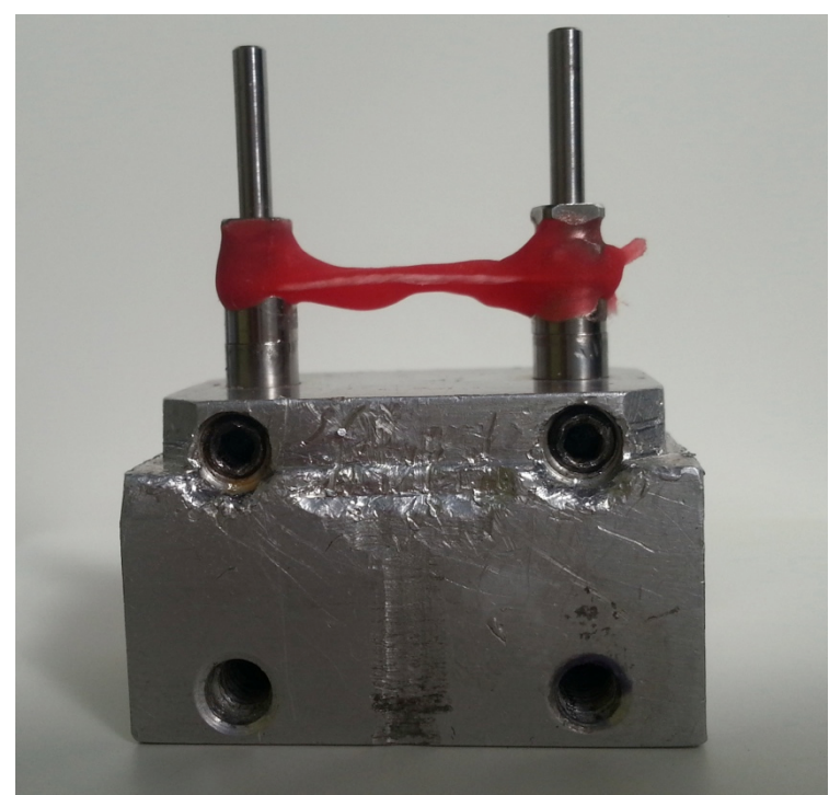
Fig. 3. Splinted squared copings using dental floss and acrylic resin – Pattern (GC Europe, Leuven, Belgium).