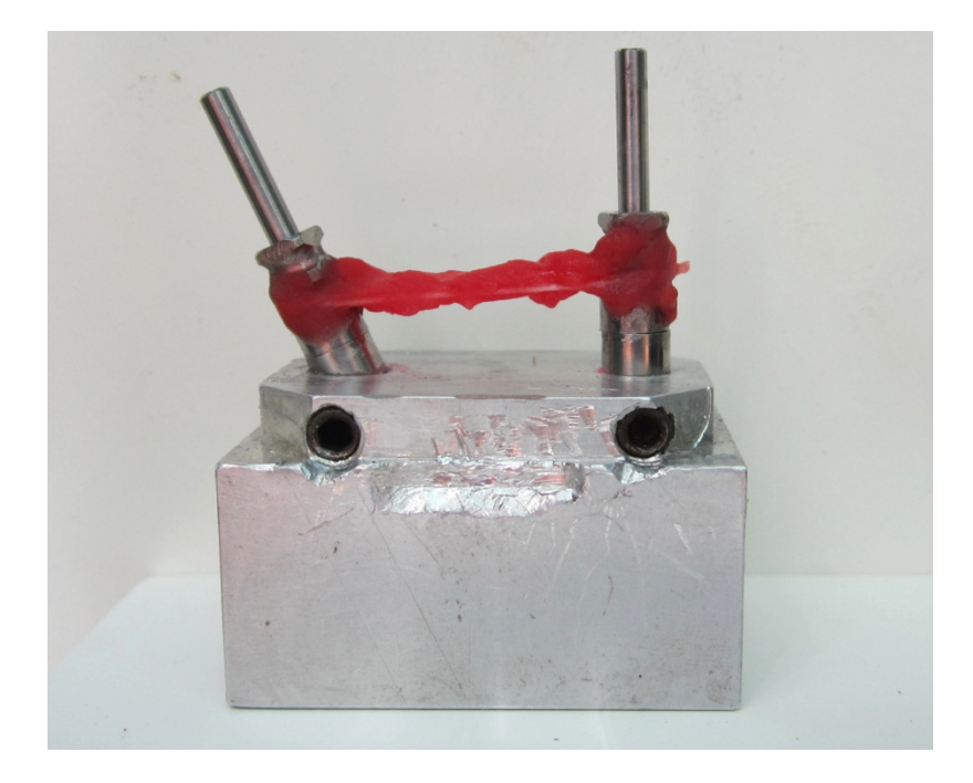
Fig. 4. Group SS: Splinted squared copings with dental floss and acrylic resin